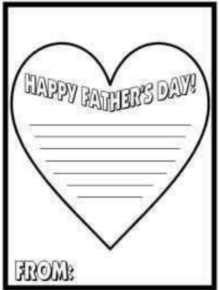
Inside of Card